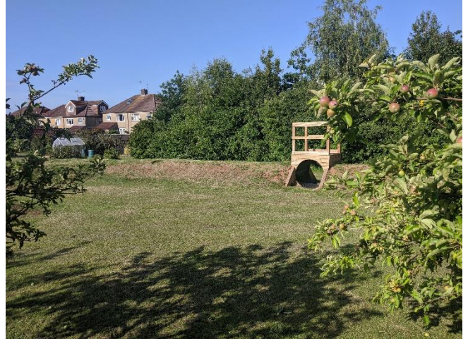
Next to the field, we have a greenhouse, flower beds, a tunnel and mounds, where we can play in the summer.