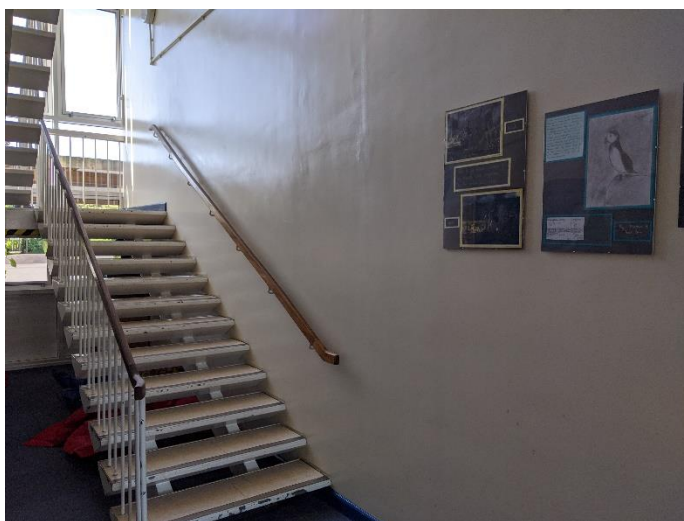
There are two sets of stairs that lead up to more classrooms. The stairs next to the Year 3 classrooms lead to the Year 6 classrooms.