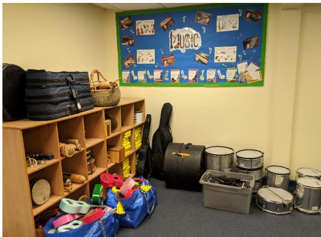
This is the music hub where small groups can work and where instruments are kept.