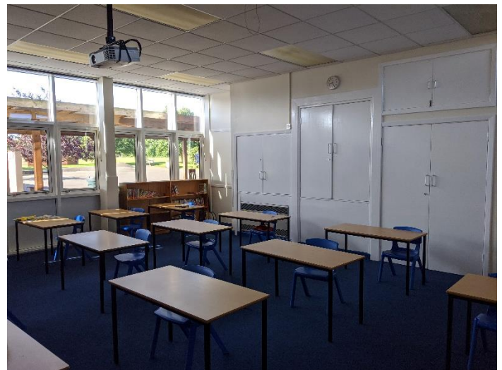
This is the Archerfish classroom.