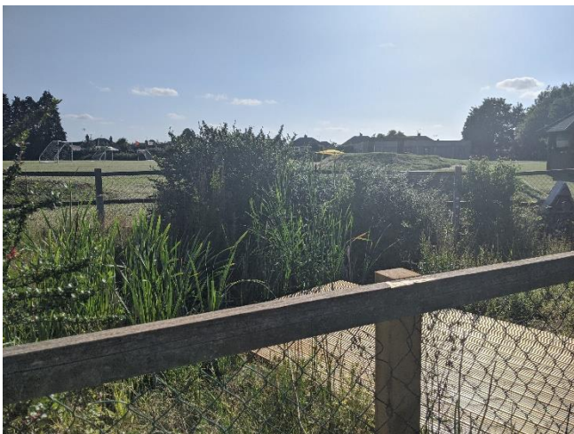
We have two ponds at BHJS. This is the large pond, which is next to the field. We often have ducks who visit as well as lots of newts.