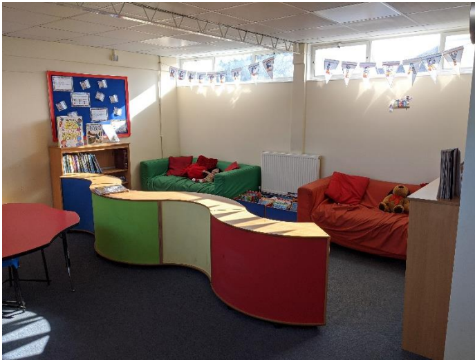
This is the Room of Magical Thoughts (RMT), where groups work.