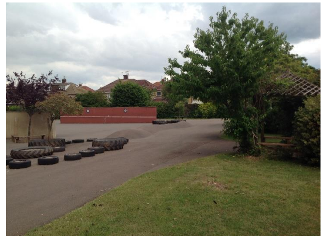
On the back playground, we have giant tyres and mounds that we can play on.