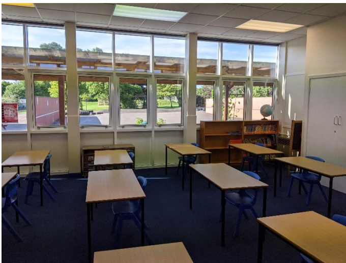
This is the Angelfish classroom.