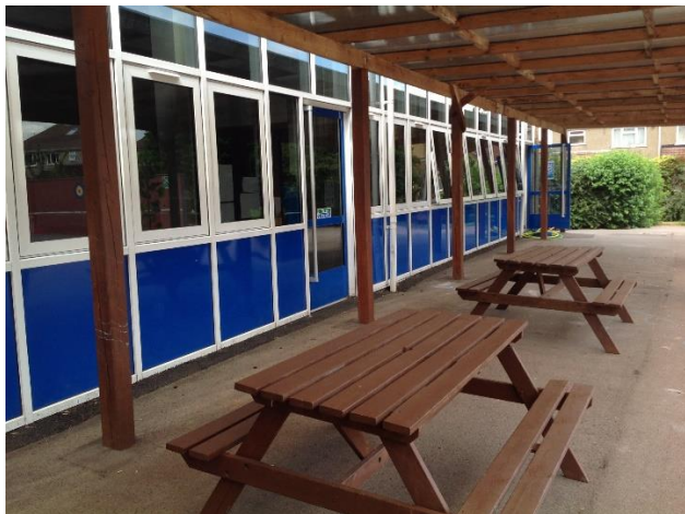
We have picnic tables outside the Year 3 classrooms that are sheltered by the canopy if it rains or is really sunny.