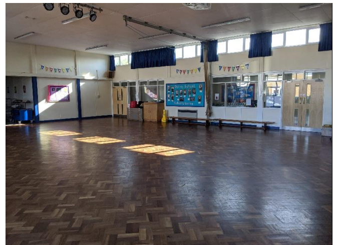
This is the school hall.