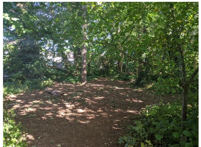
We have the woods, which we use for outdoor learning and lunchtimes in the summer.