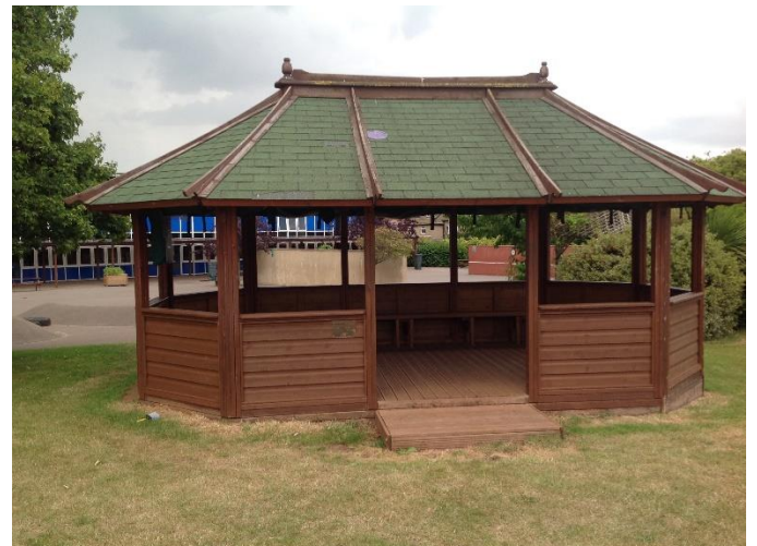
We can work and play in the Learning Lodge, which is at the edge of the field.