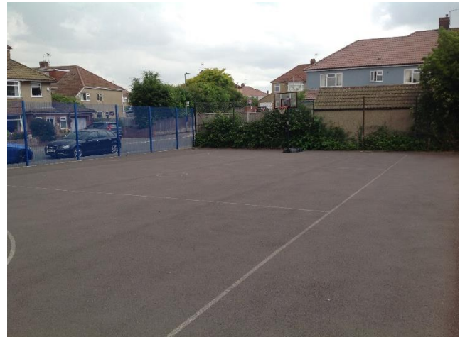
On this playground, we have basketball hoops and we can also use this area for P.E.