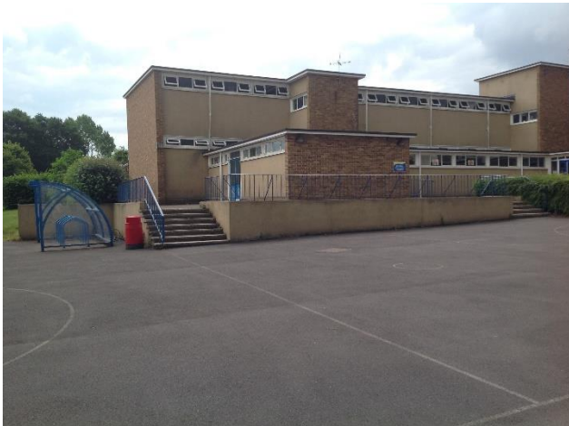
This is the front playground, where we come into school and play at break and lunchtimes.