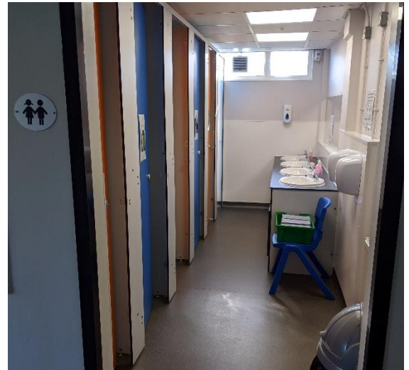
These are the downstairs toilets that Year 3 can use. Boys and girls can use these toilets.