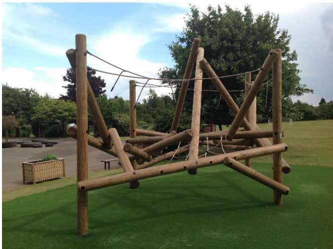
The wooden climbing frame is next to the field and the back playground.