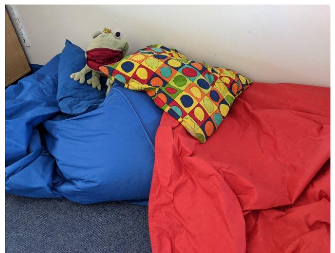
There is a quiet and calm space under the Year 6 stairs that some children may use to help them.