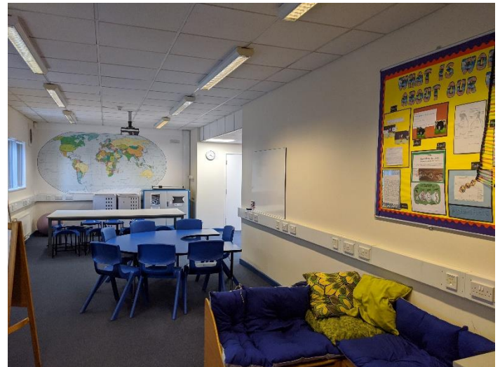
This is the ILC where we keep the laptops and where groups can work.