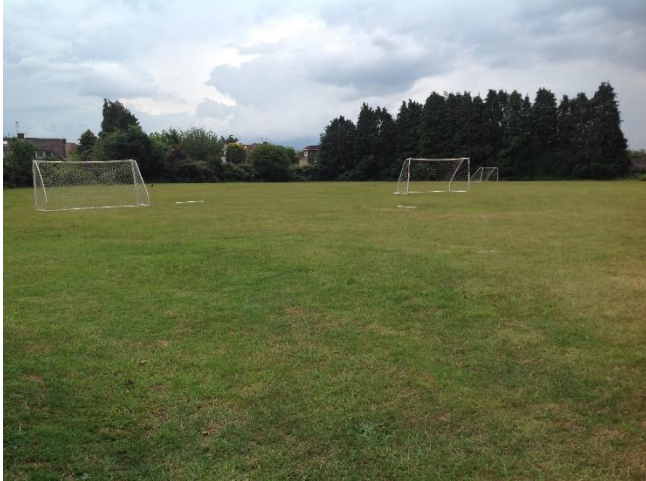
We have a huge field that we use for playing on at lunchtimes and for PE when it is dry.