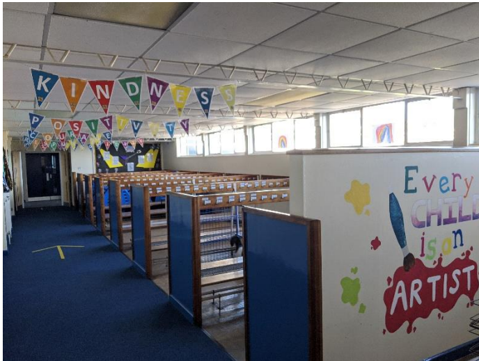
These are the cloakrooms where you will have your own peg.